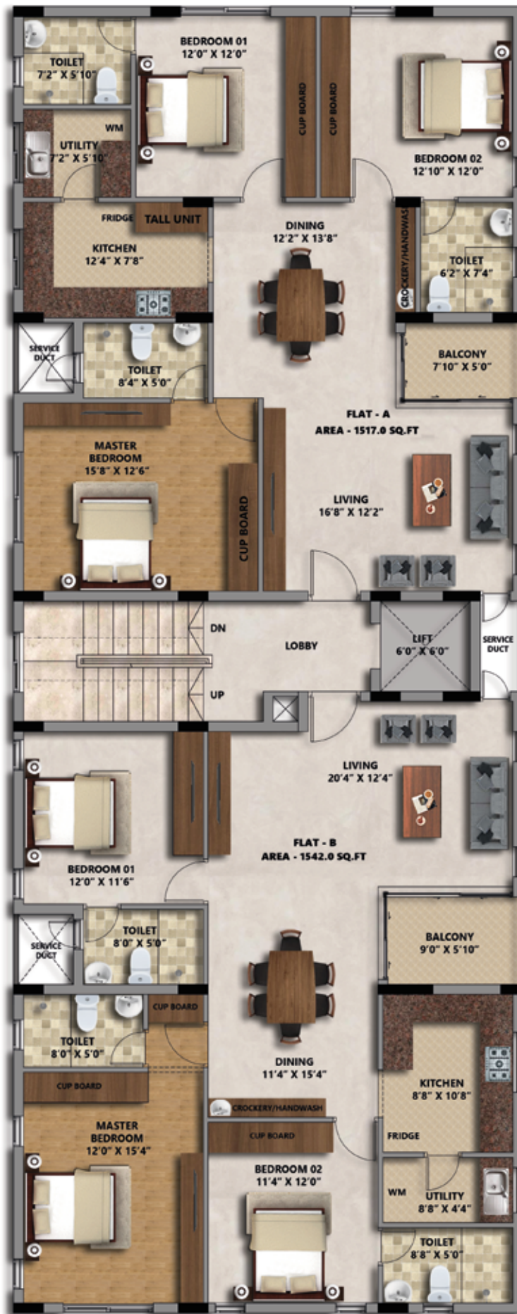
TYPICAL FLOOR PLAN (1 st to 5 th Floor)