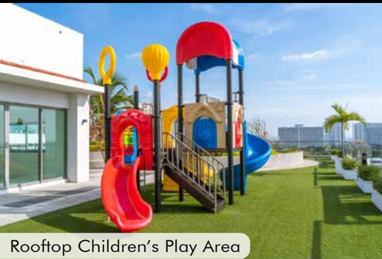
Rooftop Children's Play Area