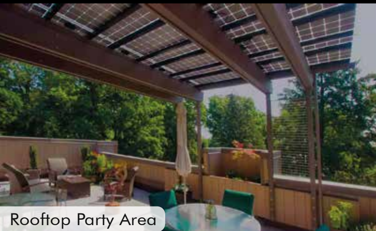
Rooftop Party Area